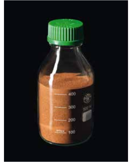
BC. ATOX Scon binds hydrogen sulphide as hard to dissolve iron sulphide